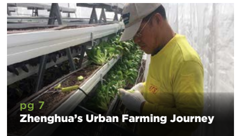
pg 7 Zhenghua's Urban Farming Journey