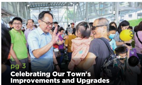
pg 3 Celebrating Our Town's Improvements and Upgrades