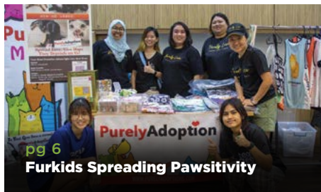
pg 6 Furkids Spreading Pawsitivity