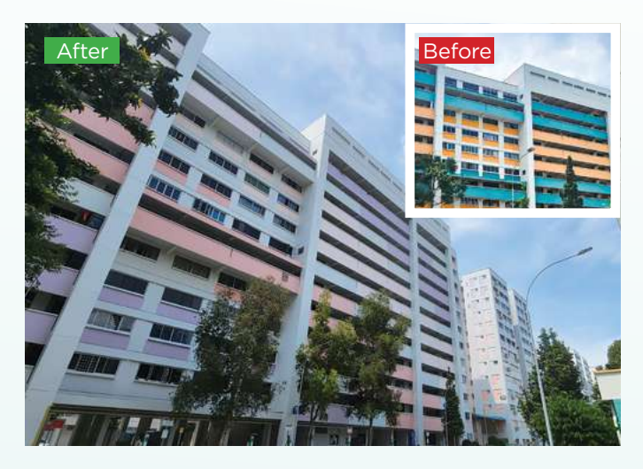
▲ Blks 201-233 Petir/Pending Rd