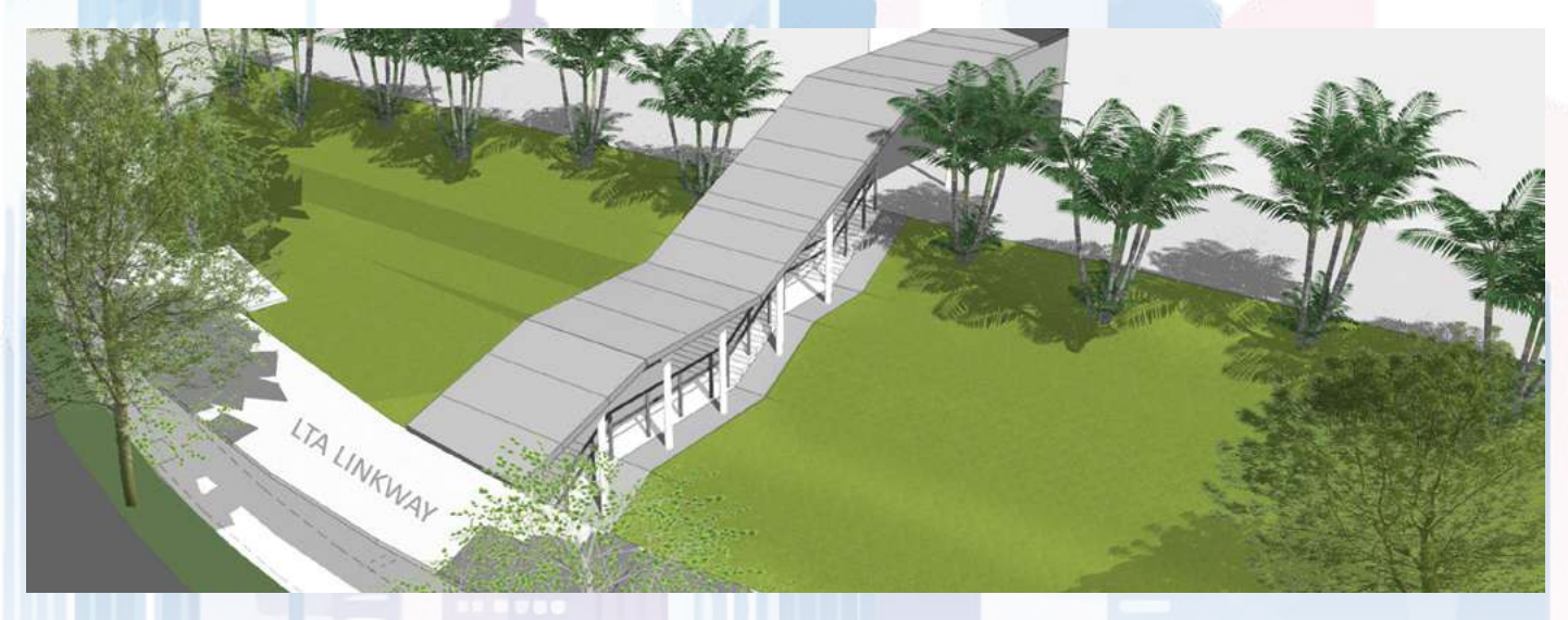
▲ Proposed Covered Linkway over Existing Staircase at Blk 607 Senja Rd