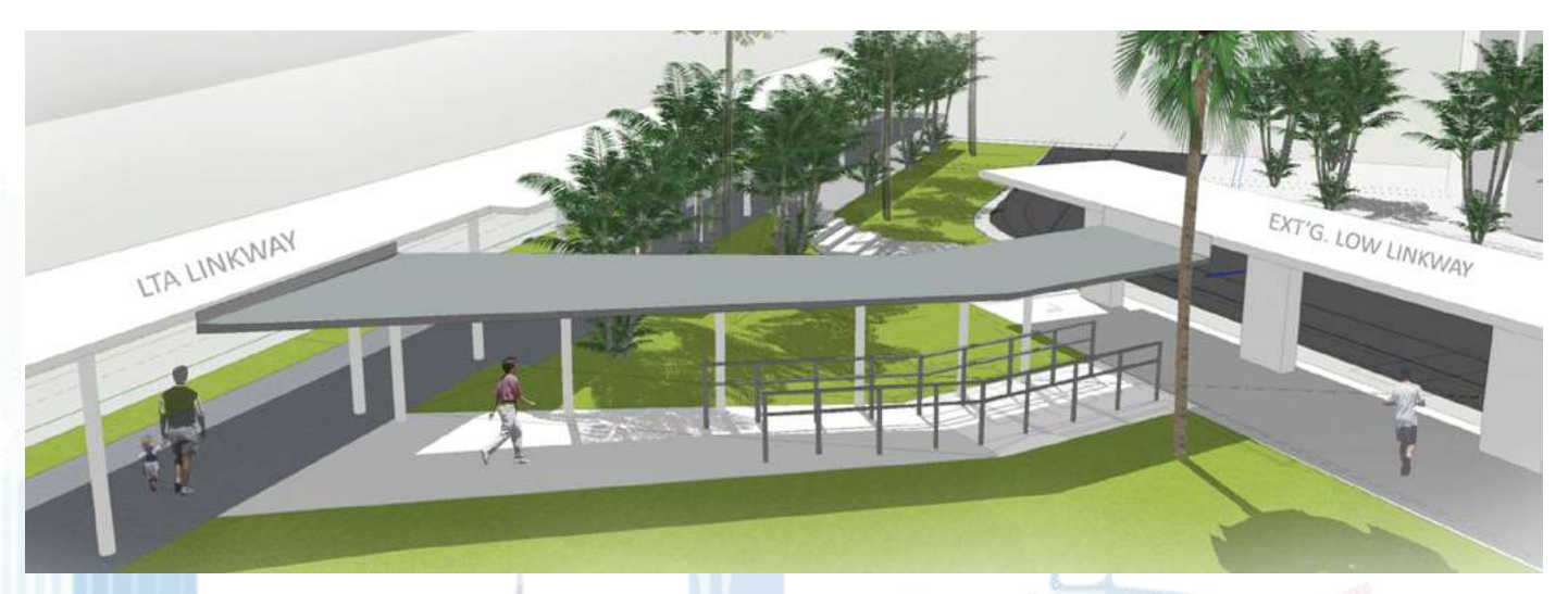
▲ Proposed Covered Linkway over Existing BFA Ramp at Blk 182 Jelebu Rd