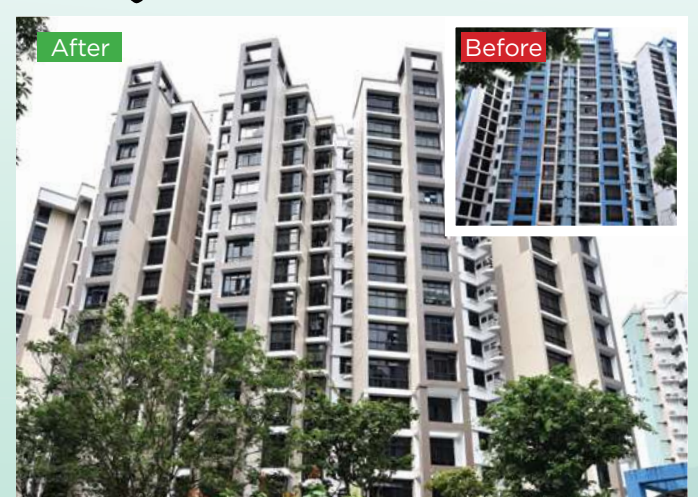
Blks 465-484 Segar Rd