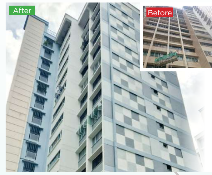
▲ Blks 201-206 Clementi Ave 6