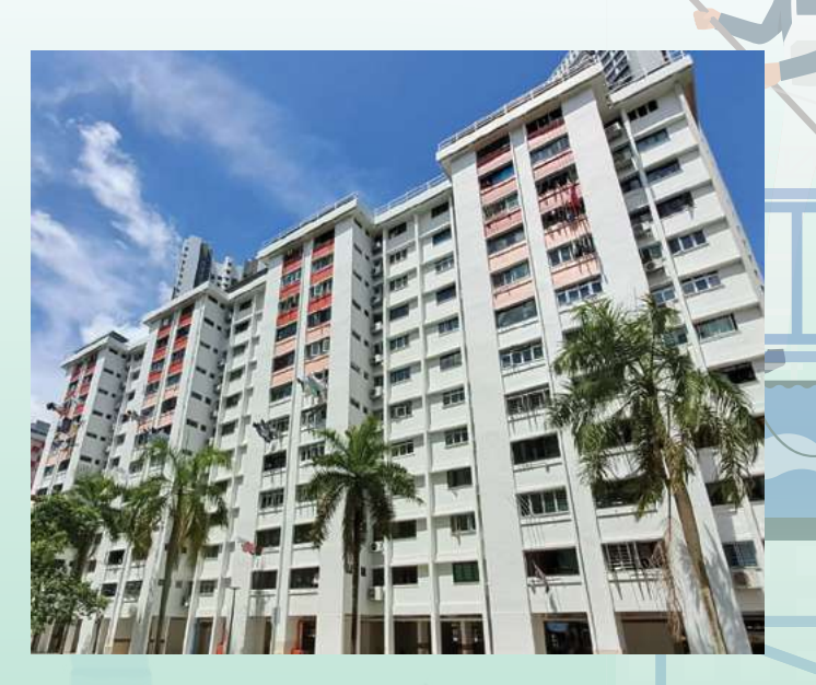
▲ Blks 315-320 Clementi Ave 4