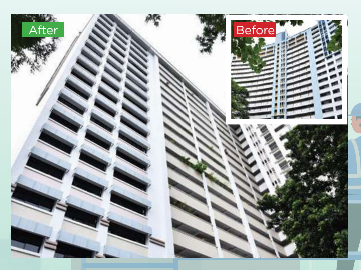
▲ Blks 613-624 Bukit Panjang Ring Rd/Senja Rd