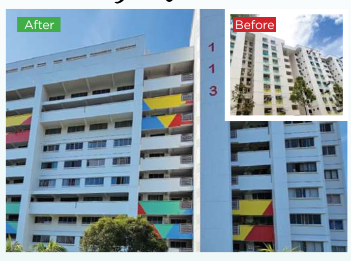
▲ Blks 101-129 Gangsa Rd