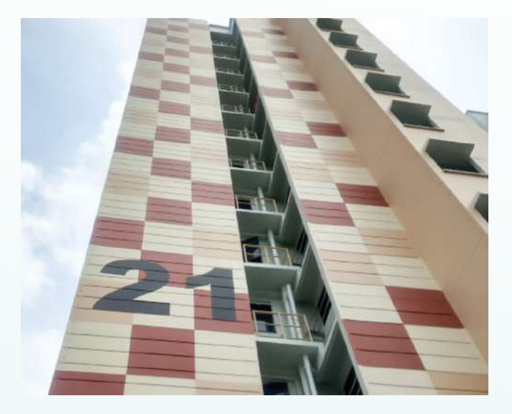
▲ Blk 21 Toh Yi Dr